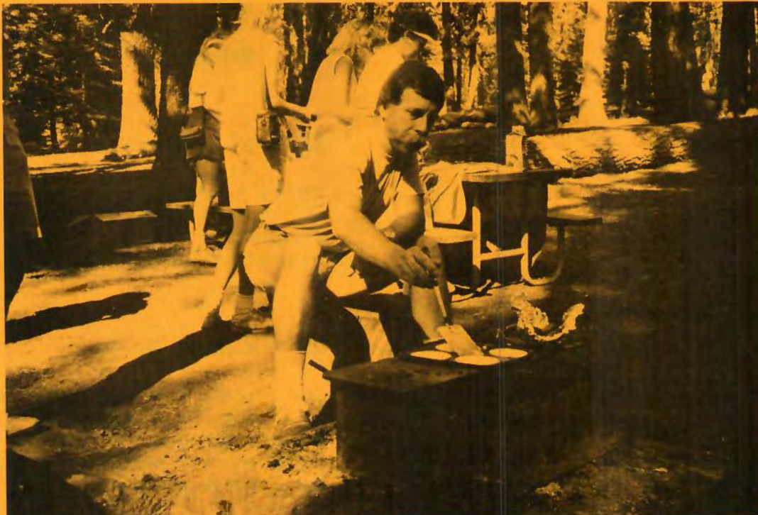
SEQUOIA MEALS A'LA DWINGER 1987 SUMMER TOUR